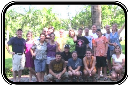
2011 Costa Rica Mission Team