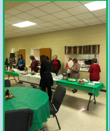
The Preschool Staff enjoyed a Christmas Breakfast On December 15th.